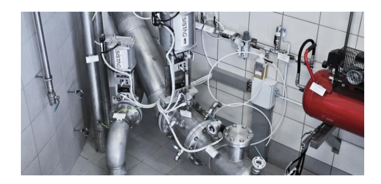
Type of project:

Municipal WWTP SIFFIANO 6.500 P.E.: Design and construction of a wastewater treatment plant dimensioned for 6,000 inhabitants. The plant is an MBR plant (membranes - bio - reactor) with desanding, deoiling, fine screening, a storage silo for the sludge and a dewatering station