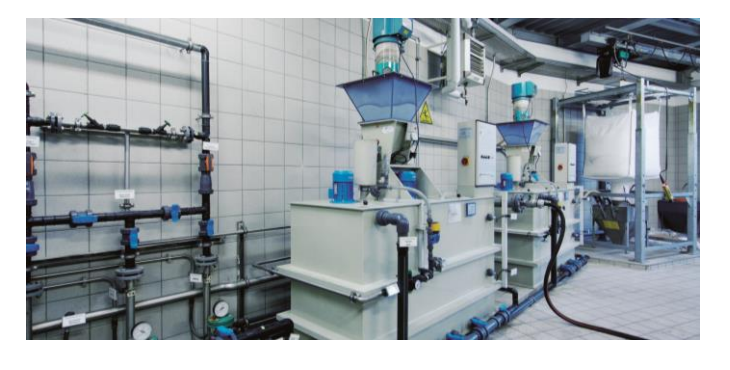
Type of project:

Expansion of the sludge dewatering line. Electromeccanical and hydraulical works on the sludge dewatering line with installation of a high pressure belt filter press.